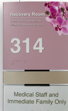
PaperFlex™ ADA-Ready™ Wall Mounted Room Identification