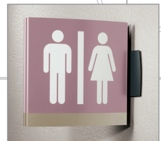
Projecting Amenity Identification Sign