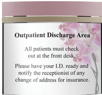
PaperFlex™ ADA-Ready™ Wall Mounted Informational