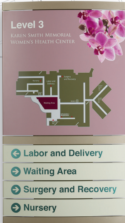
Wall Mounted Directional and Orientation Map