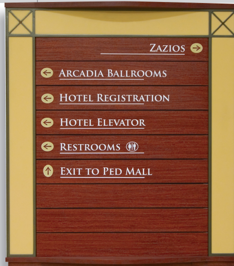
Wall Mounted Directional