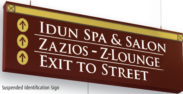
Suspended Identification Sign