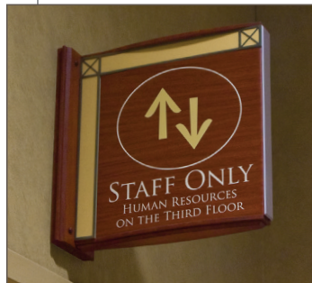
Projecting Regulatory Sign