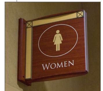
Projecting Amenity Identification Sign