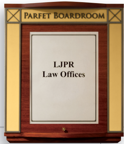
ADA-Ready™ Wall Mounted Room Identity